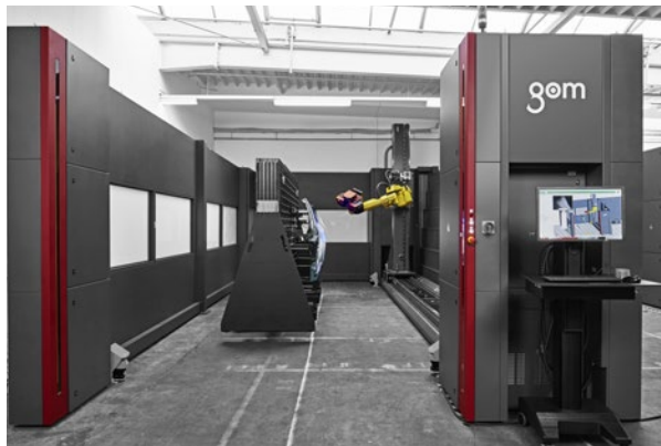
ATOS ScanBox 7260 – optical 3D coordinate measuring machine for large parts

an evaluation matrix, the managers responsible for quality assurance and measuring technology opted for 3D coordinate measuring systems from GOM, Braunschweig. These met Opel’s specific requirements regarding precision, time and cost savings, and above all, easy handling.