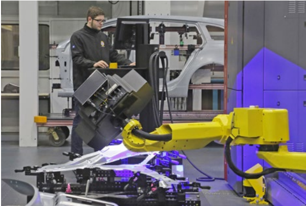
The entire measuring procedure in the ATOS ScanBox can be controlled by production staff via a simplified user interface